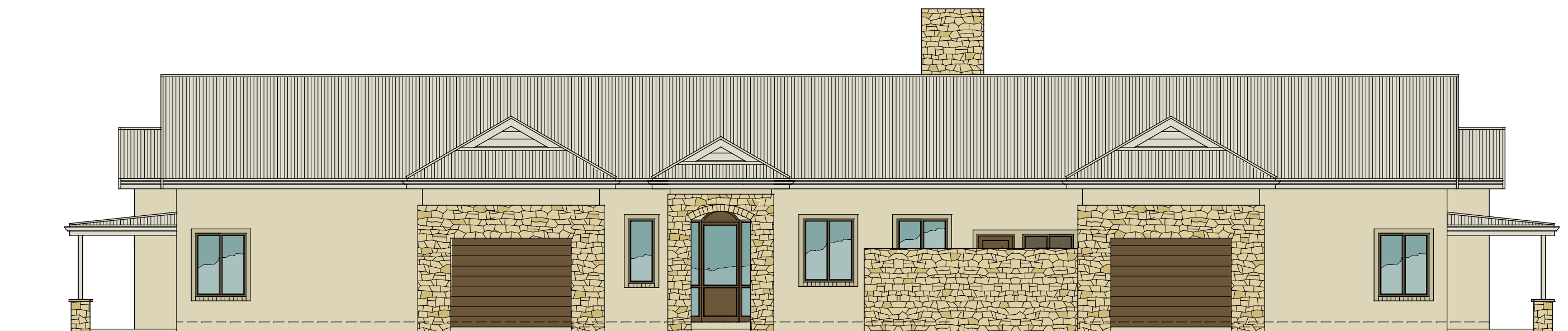
SOUTH ELEVATION SCALE 1:100