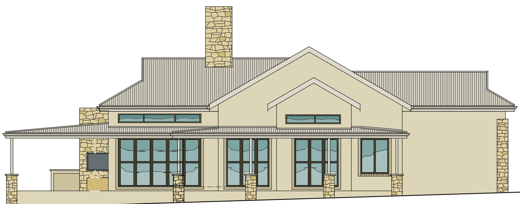
WEST ELEVATION SCALE 1:100